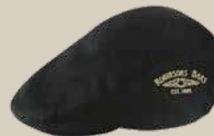
Flat Cap £15