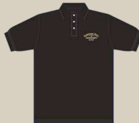
Polo Shirt £20

Official Merchandise available to purchase from the Saloon.