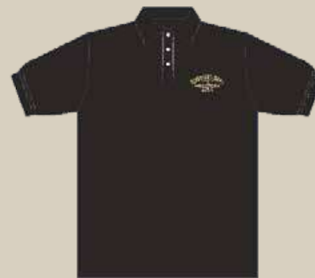
Polo Shirt £20

Official Merchandise available to purchase from the Saloon.