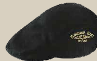
Flat Cap £15